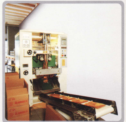
1Kg Pouch Bag Packaging