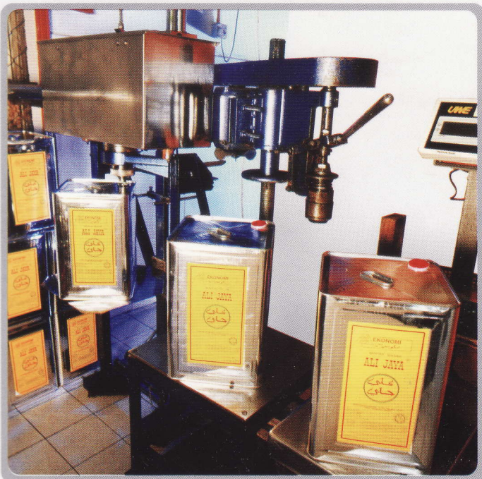
Tin Can Packaging