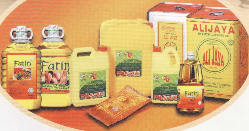
Our Product Range